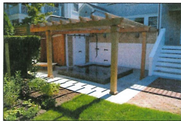
GENERAL SPA EXAMPLE WITH BLUESTONE PATIO