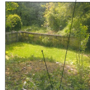
SPA AREA & EXISTING FENCE