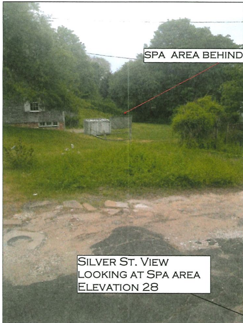
SPA AREA BEHIND PRIVET