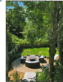
FROM HOUSE LOOKING DOWN