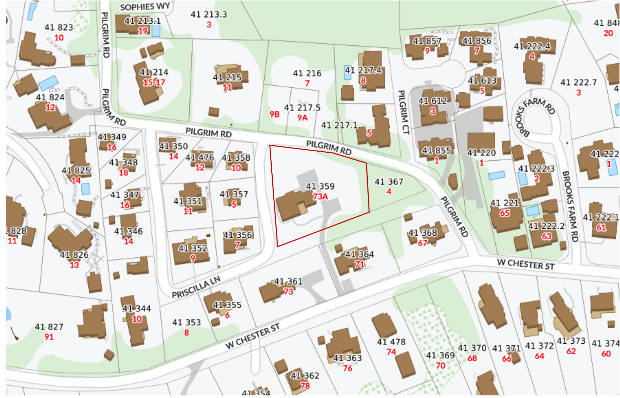
2 Locus Plan