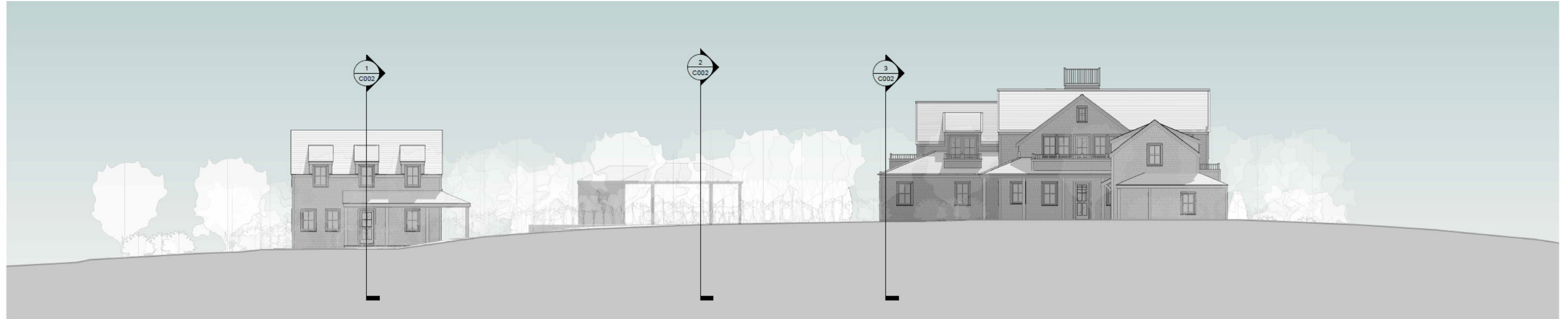
1 SECTION THRU ALLIANCE LANE 3/32" = 1'-0"