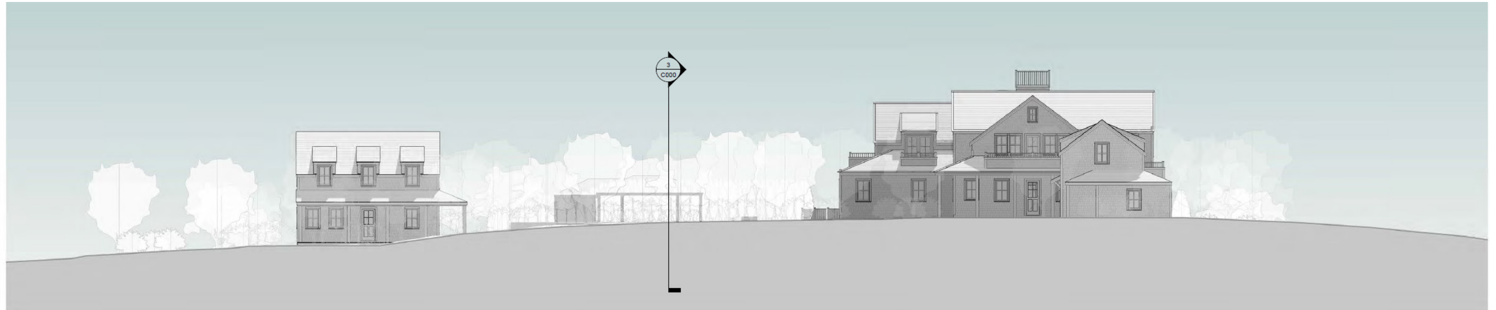
1 SECTION THRU ALLIANCE LANE 3/32" = 1'-0"