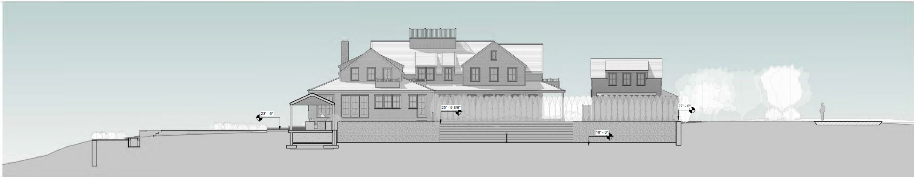
3 SECTION THRU TENNIS COURT 3/32" = 1'-0"