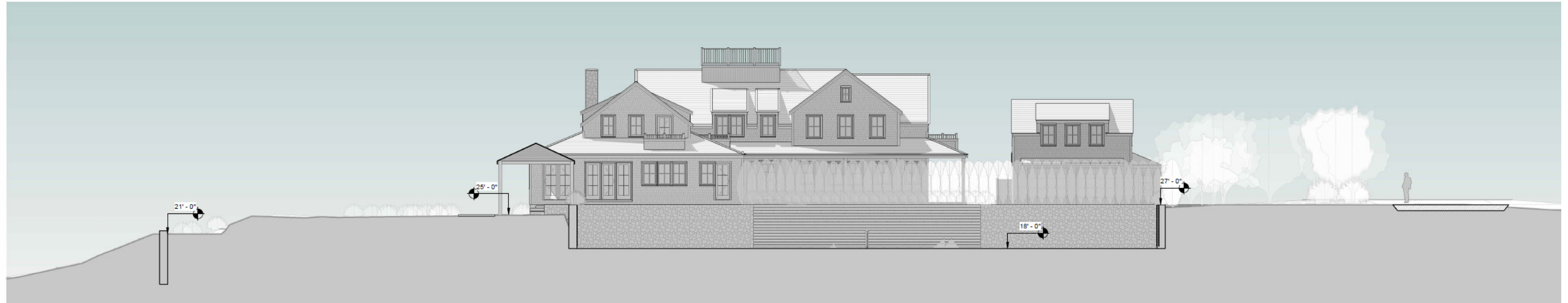
2 SECTION THRU TENNIS COURT 3/32" = 1'-0"